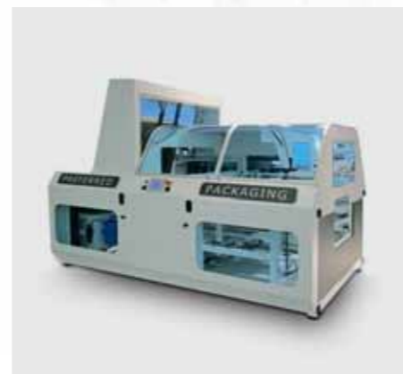
Compact & flexible.