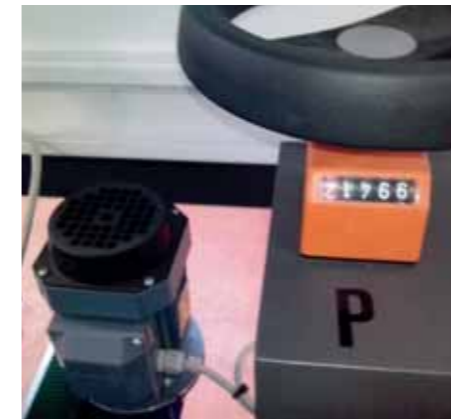
Motorized automatic adjustment.