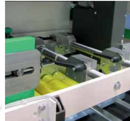
In feed conveyor with different loading systems depending on the products.