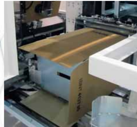
Cartons automatic opening and products insertion.