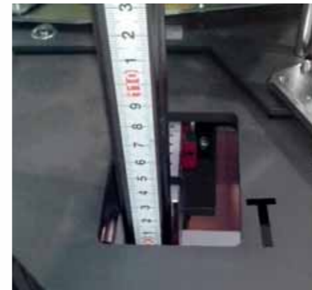
All movement and adjustment on linear guides.