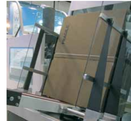
Cartons forming area with cartons storage.