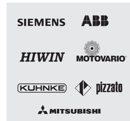
High quality components, ISO certificated.