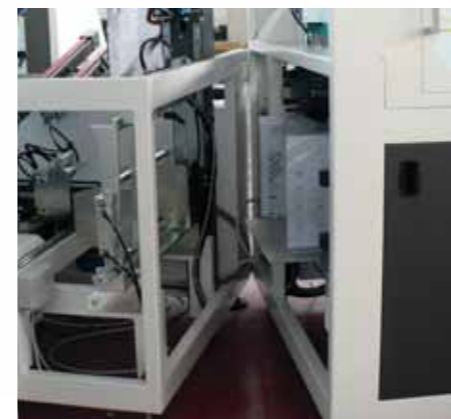
Separable loading system unit for a great accessibility of the operator and high user friendly.